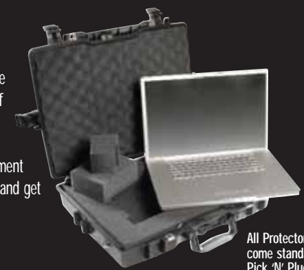
All Protector™ Cases come standard with Pick 'N' Pluck™ foam.

Pelican's Pick 'N' Pluck™ foam lets you customize the interior according to your gear. An easy, do-it-yourself system for custom-shaping the interior of the case according to your equipment. Layers of foam are pre-scored in tiny cubes. Simply measure your equipment over the grid and pluck away. Contents stay in place and get extra protection at the same time.