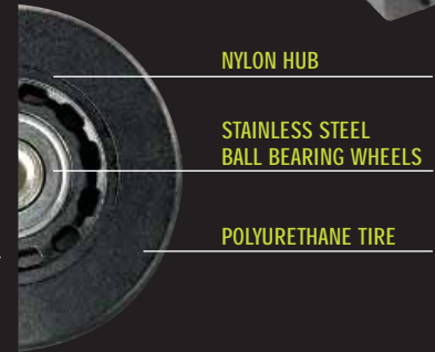
NYLON HUB STAINLESS STEEL BALL BEARING WHEELS POLYURETHANE TIRE

Stainless steel ball bearing wheels (on select cases) last longer and ride smoother. The nylon hub adjacent to the stainless steel is made to resist heat. Result: less wear and tear on the polyurethane wheel.