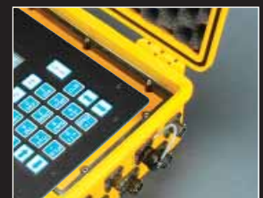
Panel frame mounting system

Customize your case to hold electronic interface panels, or create the perfect protection insert for your equipment. Close the lid and see your logo applied as a decal or hot stamp (call for details).