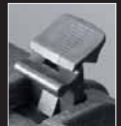
New Stronger Double-Throw Latch

The Pelican Protector™ Case uses an open cell core and solid wall construction, which is actually stronger and lighter than a solid core wall. Travel light with heavy protection. And you know it's a Pelican™ Case by the distinctive dual band top surface. Stainless steel pins are used for hinges and handles. The new Double-Throw latches are smarter and easier to open: it's the classic 'C' clamp design with a secondary movement that works like a pry bar to start the release and offers plenty of leverage to open with a light pull.